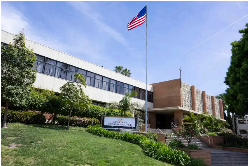
The Serenity Senior Village in San Pedro on Friday, March 13, 2026.