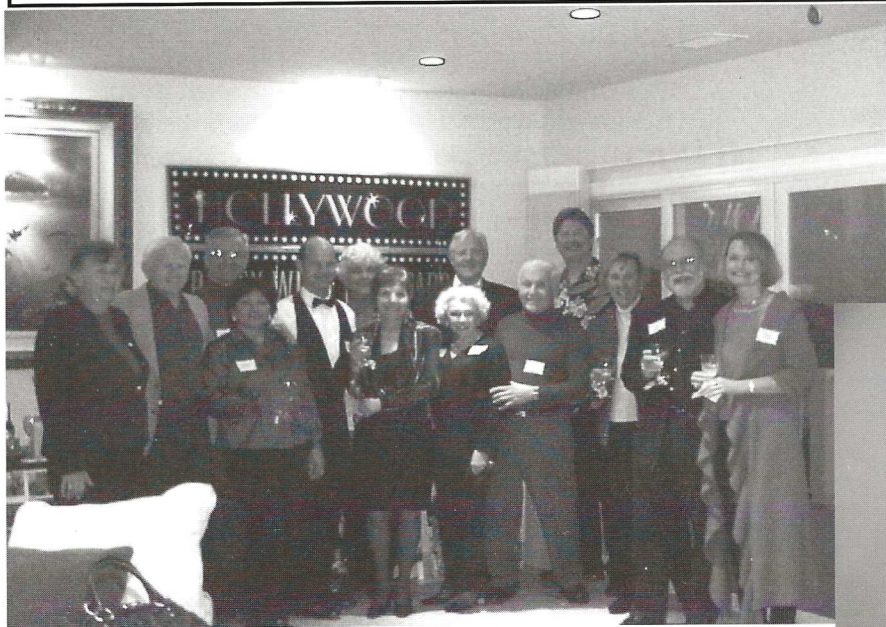
The 2007 Board Members at the New Resident's Reception

Our Member's Reception held in September marked the twelfth social event sponsored by the Association since 2001. The good feelings generated at these gatherings help the South Shores residents to get to know each other which contributes to a stronger community identity.