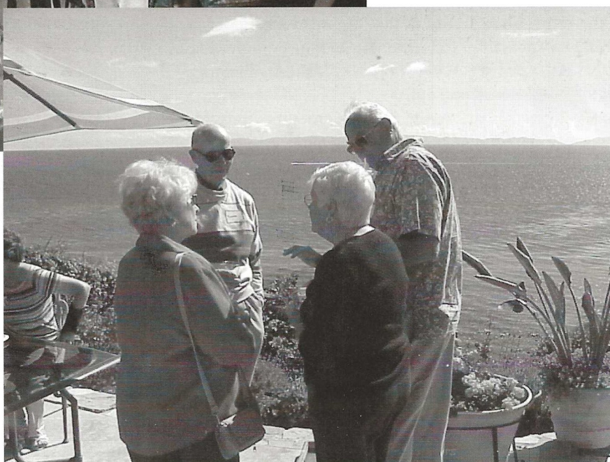
The spectacular Pacific Ocean view from the terrace.

We will hold our 6 th Annual Member's Reception in September 2008. In addition, a Family Event will be held in the Spring or Summer. Invitations will be distributed and details will be posted on our website. Also look for e-mails announcing South Shores Dinner Dances at the Elk's Club.