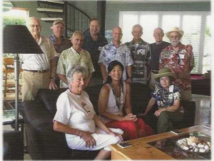
Above: South Shores Homeowners' Association Board Members