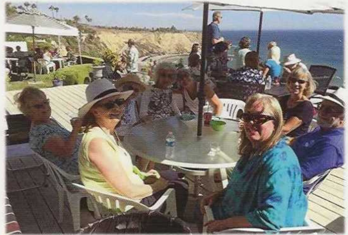
Above: Members overlooking Royal Palms

Below: Delicious food was enjoyed by all