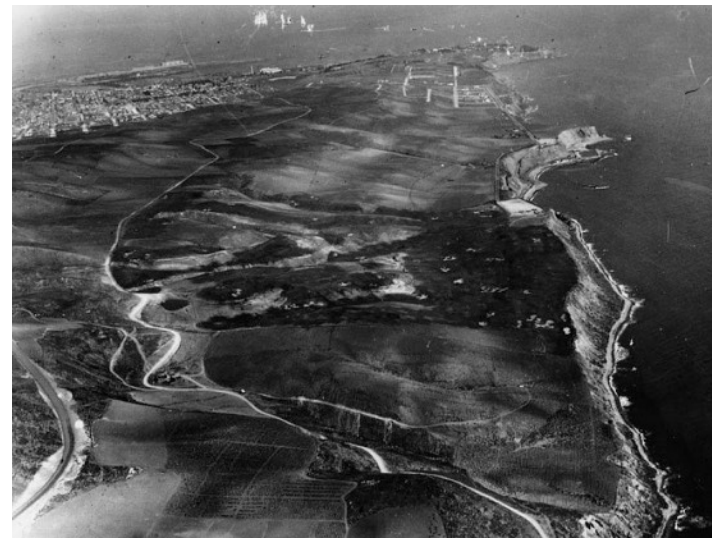
1920's Aerial View of South Shores showing golf course