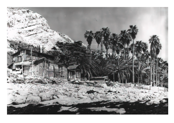
Family Home - Royal Palms - circa 1950s