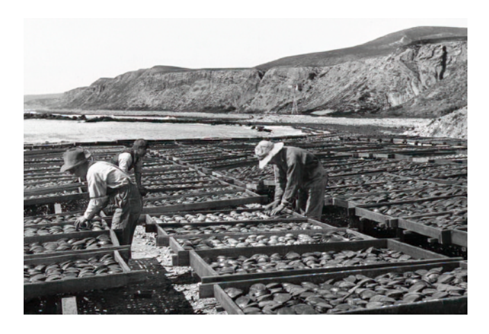
Abalone Fisherman at Royal Palms - Circa 1905