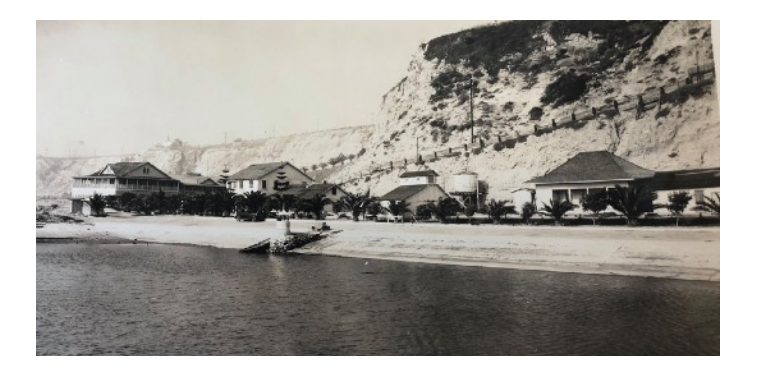
Material from this structure can still be seen today