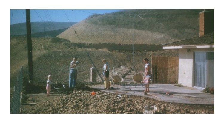
1700 block Grenadier Dr looking west - Circa 1961