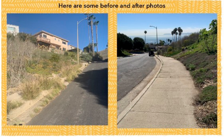
The scope of work is limited to public spaces such as sidewalks, the public easement side of sidewalk (with homeowner approval) and the slope side of various streets in the South Shores area.

e recently kicked off our program by tackling the overgrown grass that has developed at the top of Mermaid Drive in upper South Shores. This particular area was selected because the sidewalk is basically unusable due to the overgrowth.