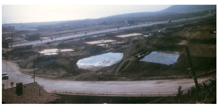
Anchovy Ave - Upper South Shores - Early Construction