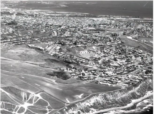
South Shores 1966