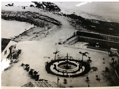
Royal Palms - Fountain & Pool

Today, South Shores keeps much of its original charm with the neighborhood seeing mild to moderate changes. A constant is its serene position located along the ocean directly in front of Catalina Island.