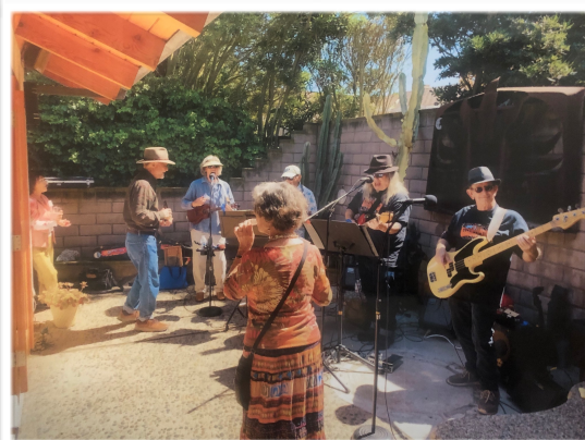
Live music by the "The Rumble"

Plans are underway for this year's reception, celebrating our 55th year. Being invited to this event is one of benefits of being an Association member.