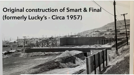
Original construction of Smart & Final (formerly Lucky's - Circa 1957)

Prior to the 1950s, however, South Shores at various times: was under the control of the Federal Government for coastal defense during WWII; was populated by farms; was the home of a hot springs hotel at White Point and Royal Palms; and in the 1920's had an 18 hole golf course that stretched along the flat area north of the bluffs along today's Paseo Del Mar and Warmouth Street. There were two structures at that period which occupied the area including the golf course gate house on the southern side of what is now Paseo Del Mar and Western Avenue. There was also a fairly large golf club house which sat at approximately Paseo Del Mar and Anchovy Avenue. While the gate house remains with us to this day, the golf club house tragically burned down (it was said by vandals), possibly in 1955.