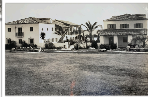
Old clubhouse on former golf course (Paseo Del Mar & Anchovy Ave.)