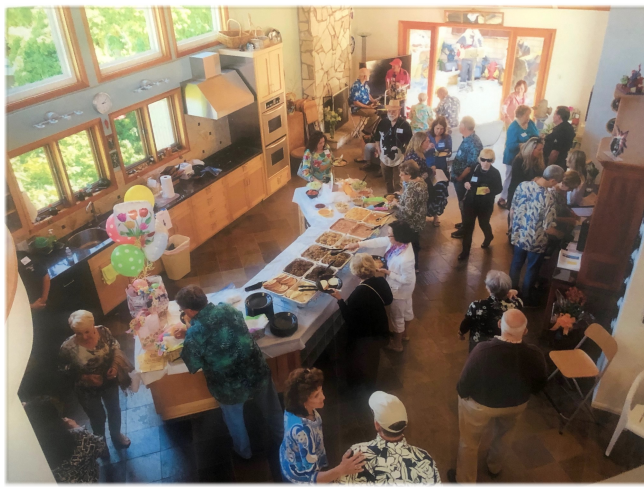
Members enjoying buffet