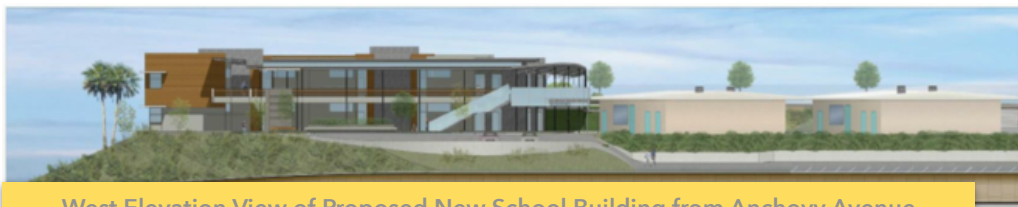
West Elevation View of Proposed New School Building from Anchovy Avenue

The second story of the new building may affect additional neighbors' views. Two public awareness meetings were held at the elementary school auditorium; one on May 30 and another on November 7, 2018. Attendance was low, as meeting notifications were limited to single-page photocopied notices that were hand delivered to some mailboxes. At the November meeting, only two South Shore residents were present. No SSCA Board member received a notice in their mailbox. South Shores residents are encouraged to review the construction project plans that are now uploaded to the SSCA web page at https://www.southshoresca.org/ .