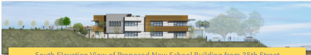
South Elevation View of Proposed New School Building from 35th Street

The Los Angeles Unified School District plans to replace four relocatable classroom buildings with a larger two story classroom building. The new classrooms would overlook homes on 35th street, South Anchovy and Abalone Avenues.